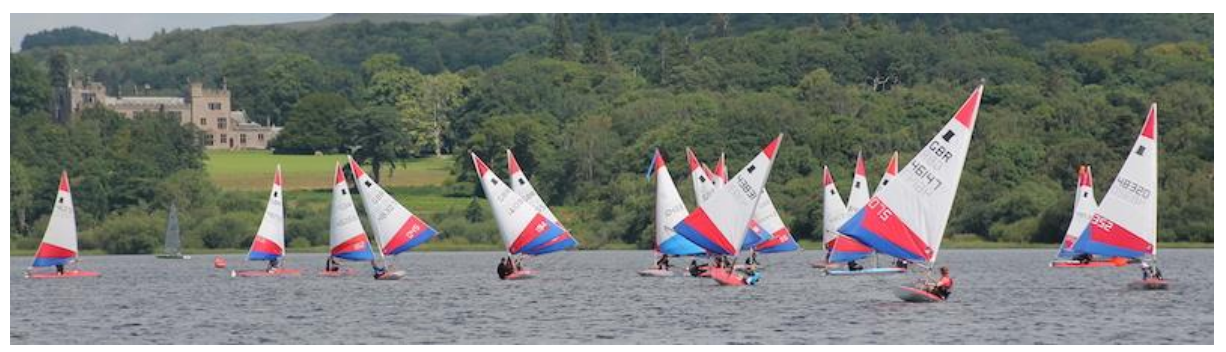
After a quiz evening on Monday and a giant paddle board session on Tuesday, Wednesday saw the regatta take a rest from the fleet races for the unique NSSA events to